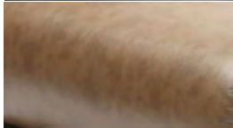
PU Nutmeg Product Code: VG700LBE